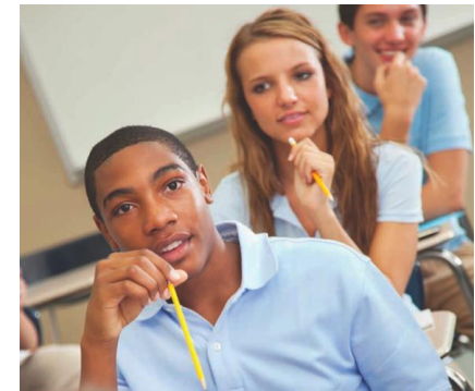
The Educational Progress of Looked After Children in England: Linking Care and Educational Data