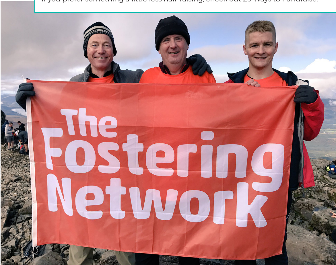
Fundraisers at the summit of Ben Nevis.

If you prefer something a little less hair-raising, check out 25 Ways to Fundraise.